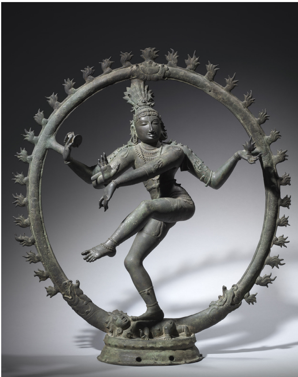
Purchase from the J. H. Wade Fund 1930.331. Cleveland Museum of Art This work is not part of the required image set.

5. In your response you should do the following: