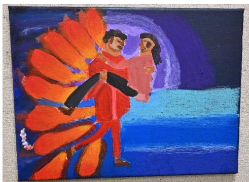
Revise Image 2

Summary: This sustained investigation demonstrates rudimentary drawing skills, with uneven use of line, mark-making, surface, space, light and shade, and composition. The technical control across the images is limited, which supports a score of 1 for Row D.